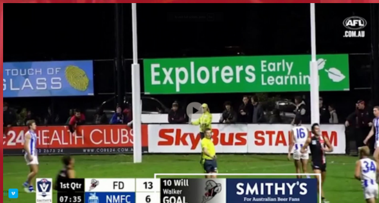
*IN-GAME STREAMING ASSET