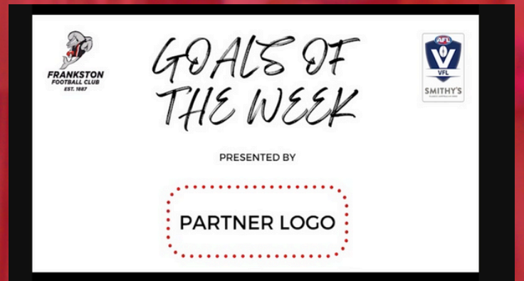
*WEEKLY SOCIAL ASSETS