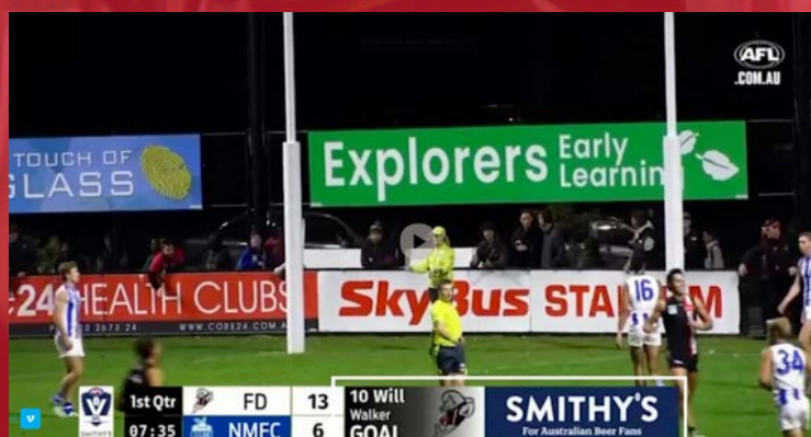
*IN-GAME STREAMING ASSET