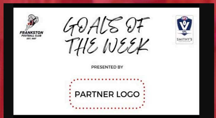
*WEEKLY SOCIAL ASSETS