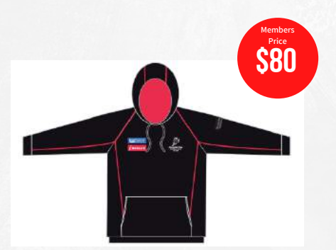
2022 UNISEX HOODIE Comfort meets style with our 2022 Unisex Hoodie. A must have for the upcoming season!

2022 PUFFER JACKET $97 Our 2022 Puffer Contrast Jacket will keep you warm when winter hits SkyBus Stadium!